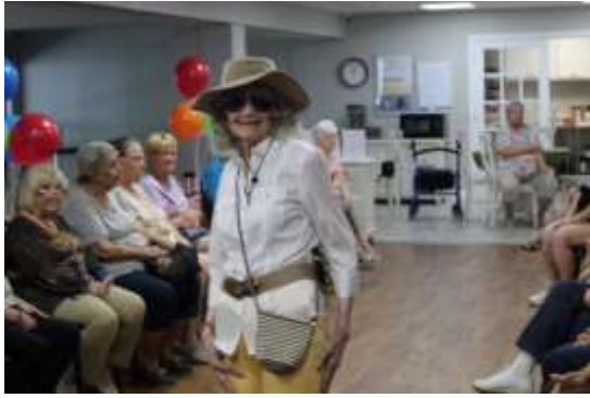
Presbyterian Apartments Residents