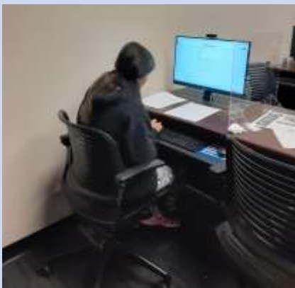
Free Resume Writing Workshops