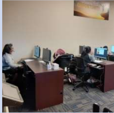
Free Digital Skills Classes

For information or address of the Goodwill Community Resource Center closest to you, click here