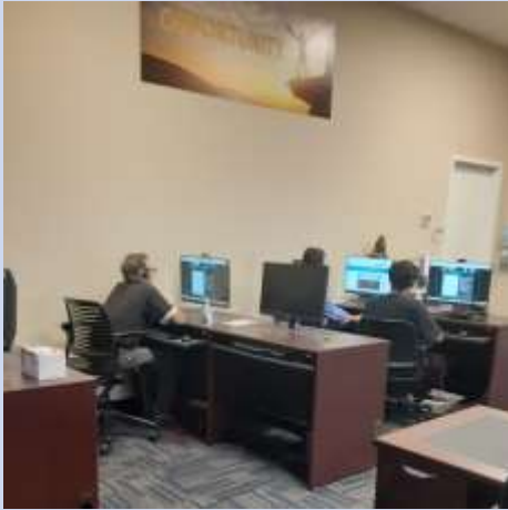
Online Orientation for new Goodwill employees