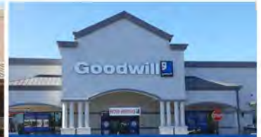
Bonita Springs (11601 Bonita Beach Road)