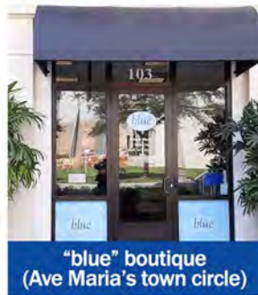
"blue" boutique (Ave Maria's town circle)