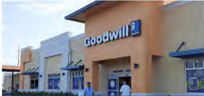
Del Prado (3226 Del Prado Blvd. Cape Coral)

We were able to acquire nearby properties at Del Prado to offer a much bigger shopping experience. Additionally, there were great commercial real estate negotiations that lead to affordable moves to expand our footprint at Kings Highway Port Charlotte, Bonita Springs, and blue Downtown Fort Myers.