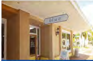
blue boutique downtown (2285 First Street, Fort Myers)