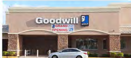
Kings Highway (24123 Peachland Blvd., Port Charlotte)