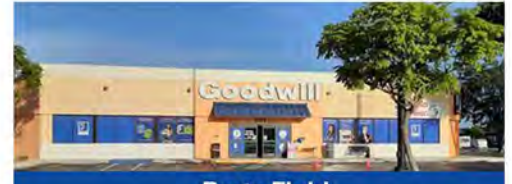
Page Field (5120 S Cleveland Ave, Fort Myers)

Our Human Resources team has been recruiting non-stop through 2021.