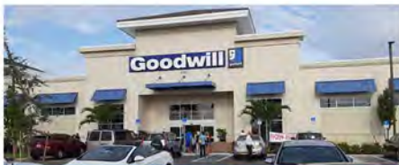
Egrets Crossing (4951 Santa Barbara Blvd., Naples)